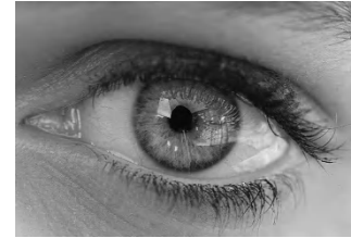
Image of iris recognition

The adoption of iris recognition function, which identifies an individual by reading his/her iris, has been increasing as a very high-level security function in mobile terminals such as smartphones or tablets and is expected to become even more widely spread.