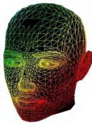
Image of face recognition

This infrared LED, equipped with a wide-angle lens, has achieved 'high output and wide directivity' that are required for face recognition on PCs and night photo or video shooting for security cameras. As face recognition functions adopted on some high-priced PCs, which recognize an individual's characteristics using photography of the face irradiated with infrared light, enable very high-level security measures, their adoption is expected to expand mainly in laptop PCs.