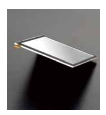
Small thickness of 0.65mm through the use of 0.4mm-thick LED and light guide

These products are based on Citizen Electronics' original optical design technology, precision tool processing technology for light guide and small-thin molding technology, with outstanding performance as follows: